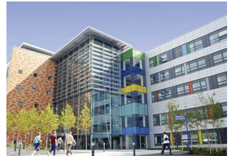
Queen Alexandra Hospital, Southwick Hill Road, Portsmouth PO6 3LY